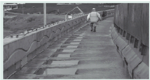
Newton No 1 Bridge with new edge barrier - traffic face.