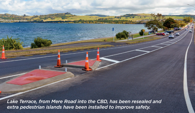
Lake Terrace, from Mere Road into the CBD, has been resealed and extra pedestrian islands have been installed to improve safety.

If you've driven along Lake Terrace recently you will have seen the resurfacing of the road between Tītiraupenga Street and Mere Road is now complete - and looking fine!