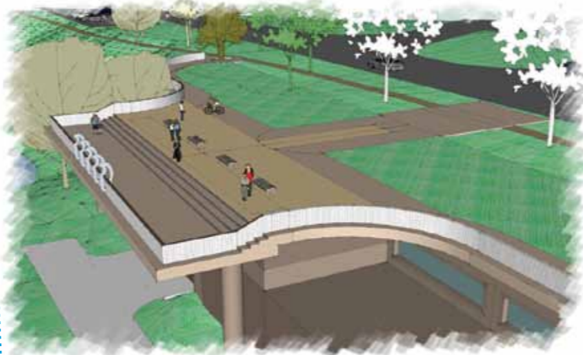
An artist's impression of what the viewing platform could look like

A lakeside viewing platform to be built above the treatment facility will be an ideal vantage point for events on the lake and has the potential for future additions such as a sculpture or water feature.