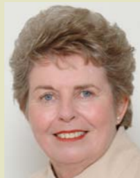
DEPUTY MAYOR CHRISTINE MCELWEE

Council has begun the task of determining what to include in a proposed Commercial and Industrial Structure Plan for Taupo town. The Plan will identify appropriate land uses and infrastructure requirements for commercial and industrial land in Council's growth management strategy - Taupo District 2050 (TD2050). The Plan will guide the future look and function of existing and proposed commercial and industrial areas around Taupo - including the Central Business District. It will also consider the best way of managing the future development of large format retail outlets. Council officers are currently talking to