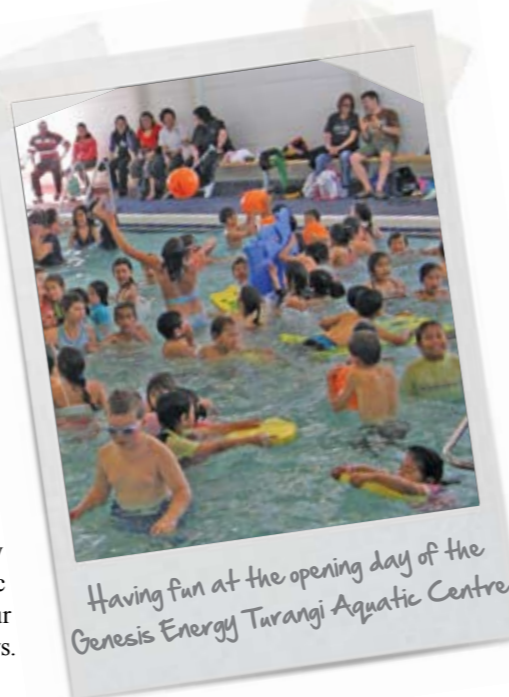
Having fun at the opening day of the Genesis Energy Turangi Aquatic Centre