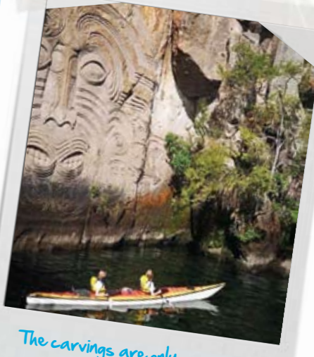
The carvings are only accessible by boat... or kayak!

The Ngatoroirangi carving took four summers to complete and the carvers took no payment other than donations to cover the cost of the scaffolding. The carvings have become an icon for our region and are a wonderful gift from Brightwell to all who live and visit here.