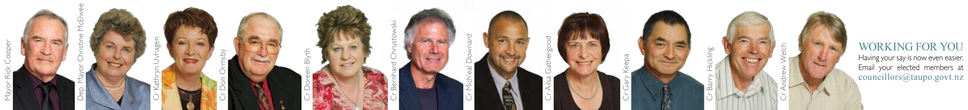
Mayor Rick Cooper