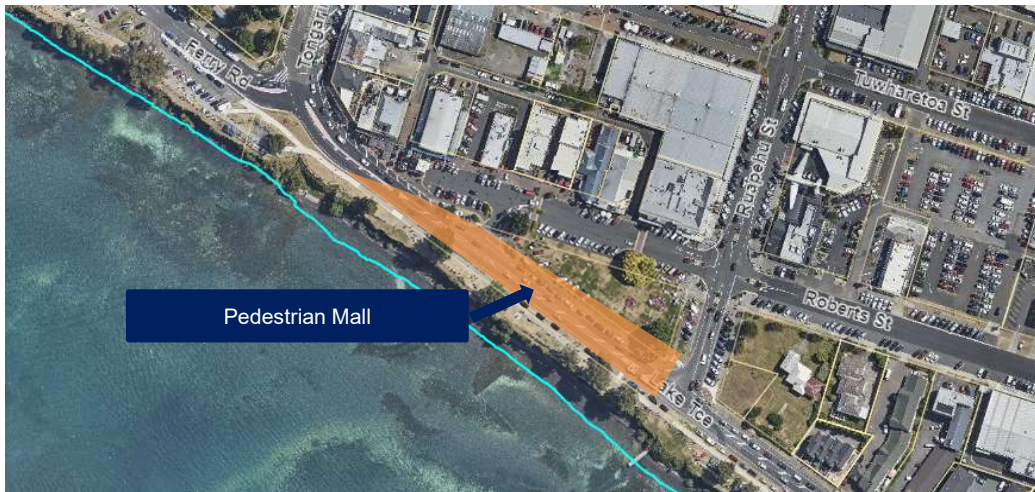
Site Location Plan: Lake Terrace