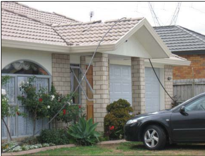
Figure 2 Conductor drop.