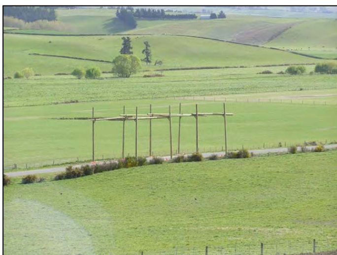
Figure 19: Typical hurdles installed to mitigate potential conductor drop during wiring.