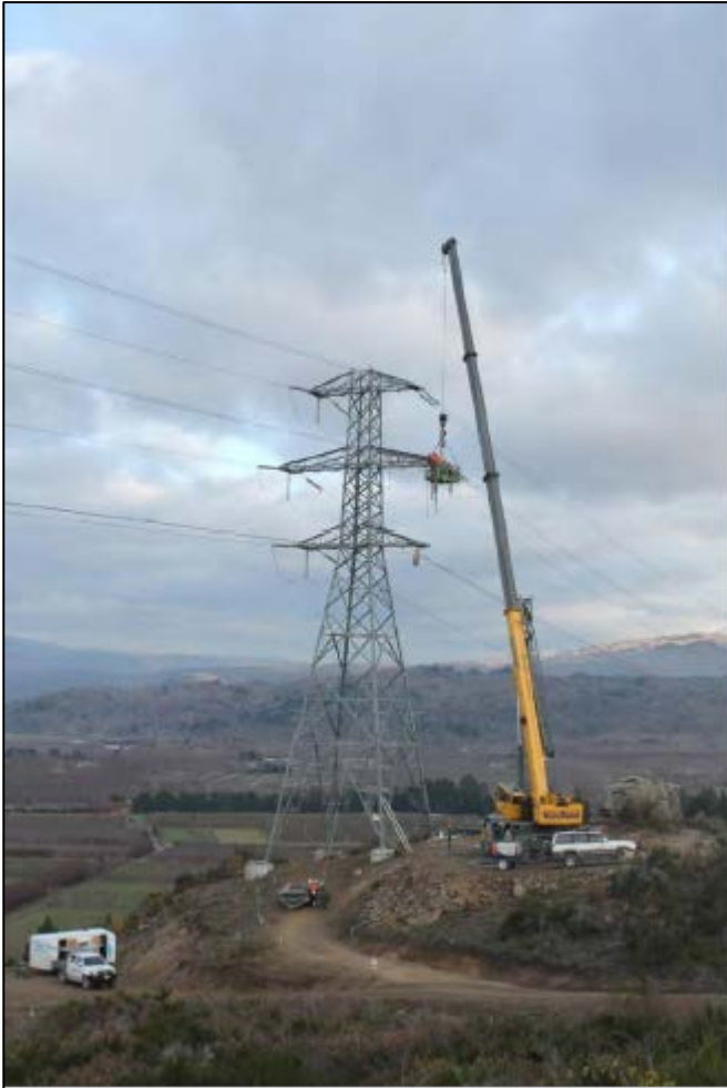
Figure 24 Example crane access required for cross arm and insulator works