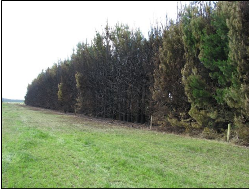
Figure 8 Tree damage from fire caused by a flash over.