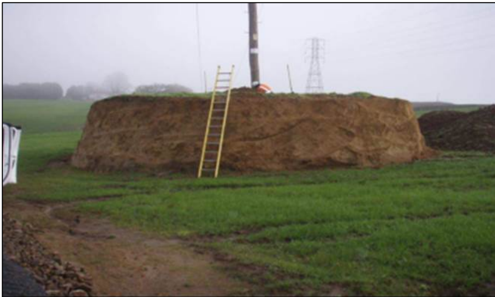
Figure 5 NZECP34 compliant earthworks around a pole on the ARI-HAM-A line

7.10 Figure 5 shows earthworks near a transmission line pole that are technically compliant with NZECP 34:2001. As a result of the earthworks near the pole structure, Transpower's ability to operate and maintain the line and structure at that location has been compromised. The batter slope may become unstable as a result of erosion and slipping. Access to the site is now severely restricted and there is no ability for Transpower to operate heavy plant on the elevated platform. Ongoing engineering checks are required to monitor the effects of erosion and to ensure the stability of the foundations.