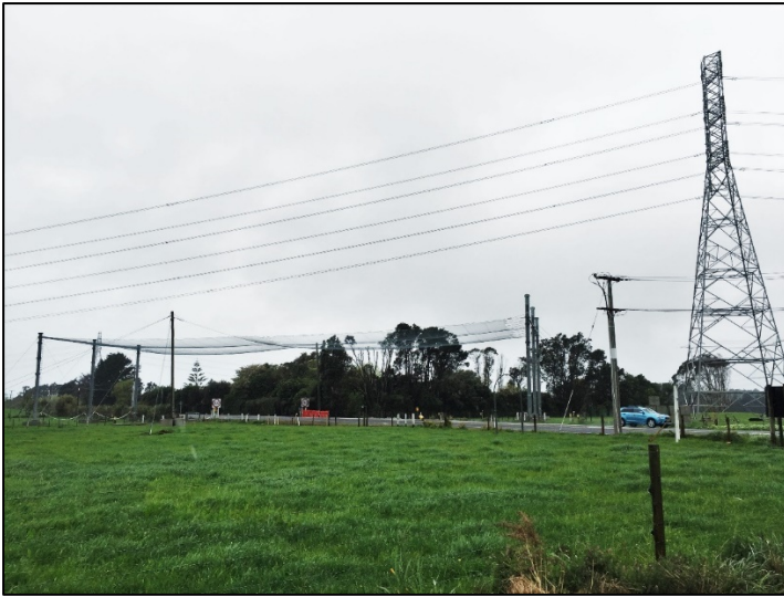
Figure 20: More substantial hurdles installed to mitigate potential conductor drop during wiring.