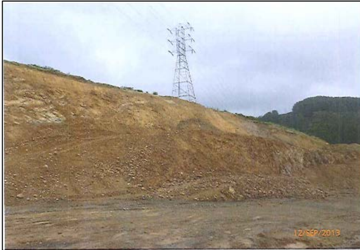
Figure 6 Earthworks in Porirua