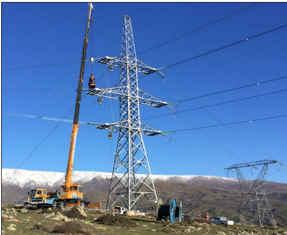
Figure 23: Crane being used for property rights to access new assets