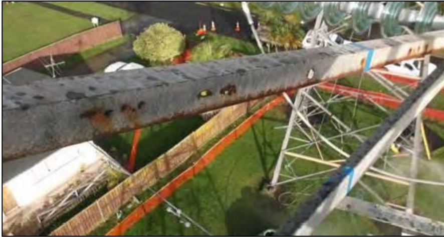
Figure 11 Tower corrosion