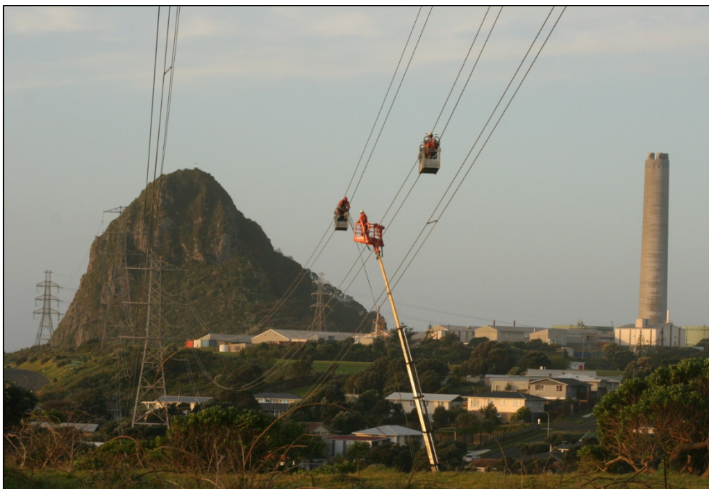
Figure 17: Conductor trolleys on duplex conductor