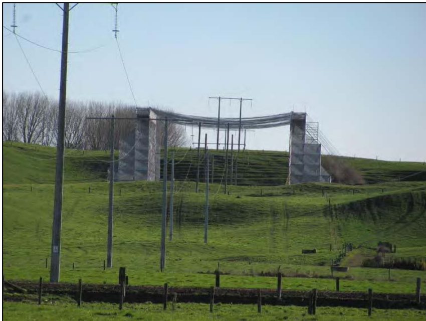
Figure 18: Scaffolding protection structure for stringing

protected by constructing high-cost scaffolding and nets. This assumes that there is sufficient space, and air clearance, on site for the construction of such structures, which is not always the case. Constructing and dismantling the scaffolding and netting 3 needed to protect the undercrossing line in Figure 18, cost in excess of $350,000.