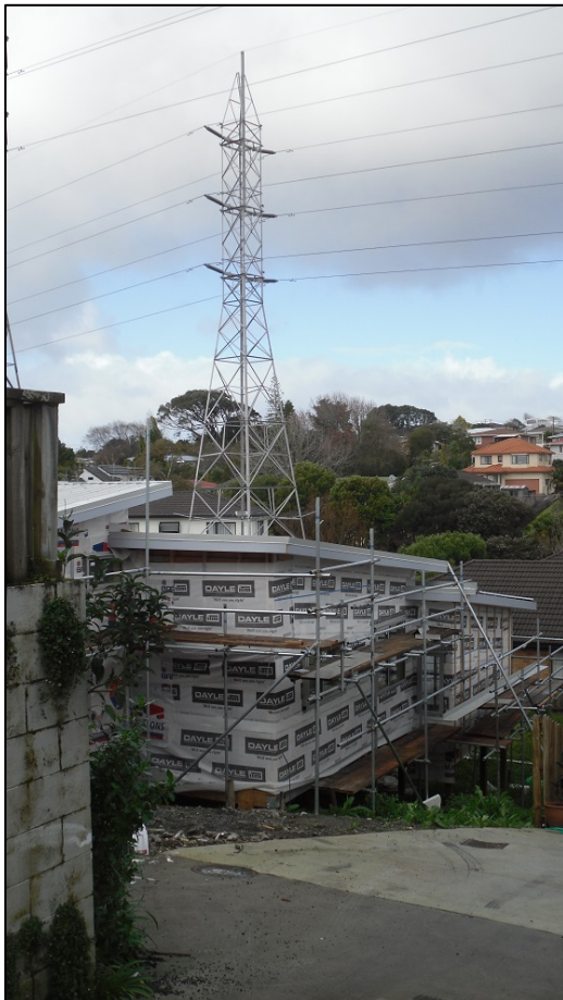
Figure 7 Dwelling blocking access to tower

construction directly below the Henderson to Roskill 110kV transmission line. Without prior consultation, this dwelling blocked access to the tower site, forcing Transpower to secure alternative access across four separate properties and requiring the removal of fencing and vegetation.