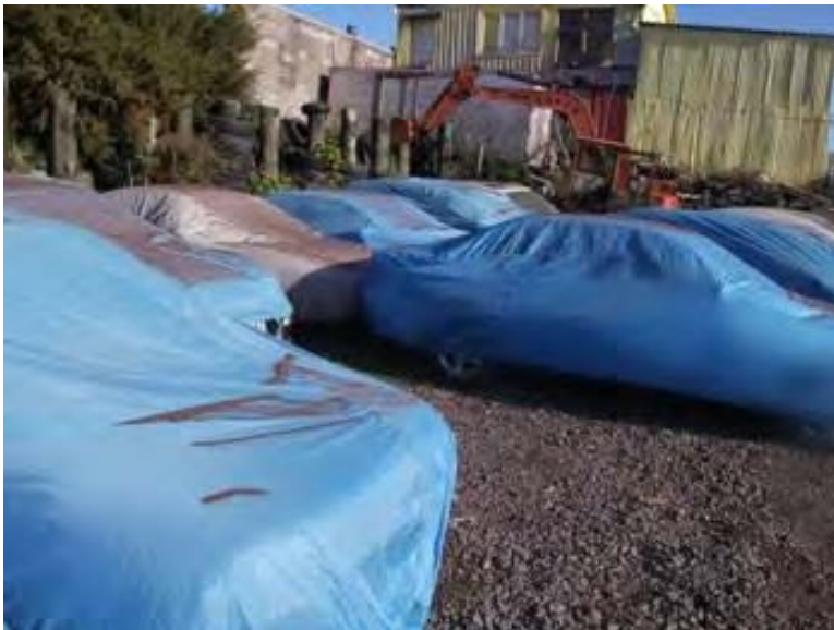
Figure 13 Tower painting in an industrial setting showing garnet debris falling onto covered cars.