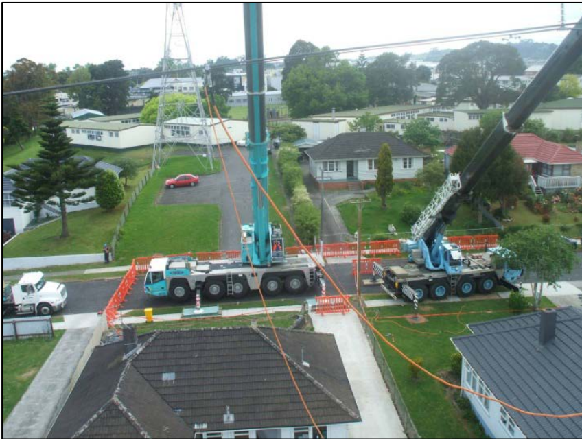
Figure 21: Reconductoring in an urban setting