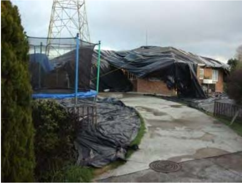
Figure 12 Tower painting in an urban setting, note the extensive polythene sheet protection.