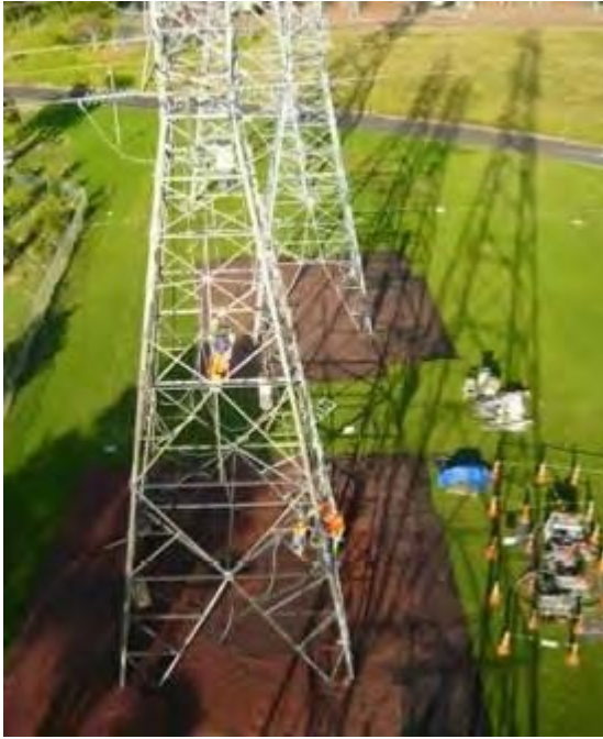
Figure 14 Abrasive blasting in area with no under-build.