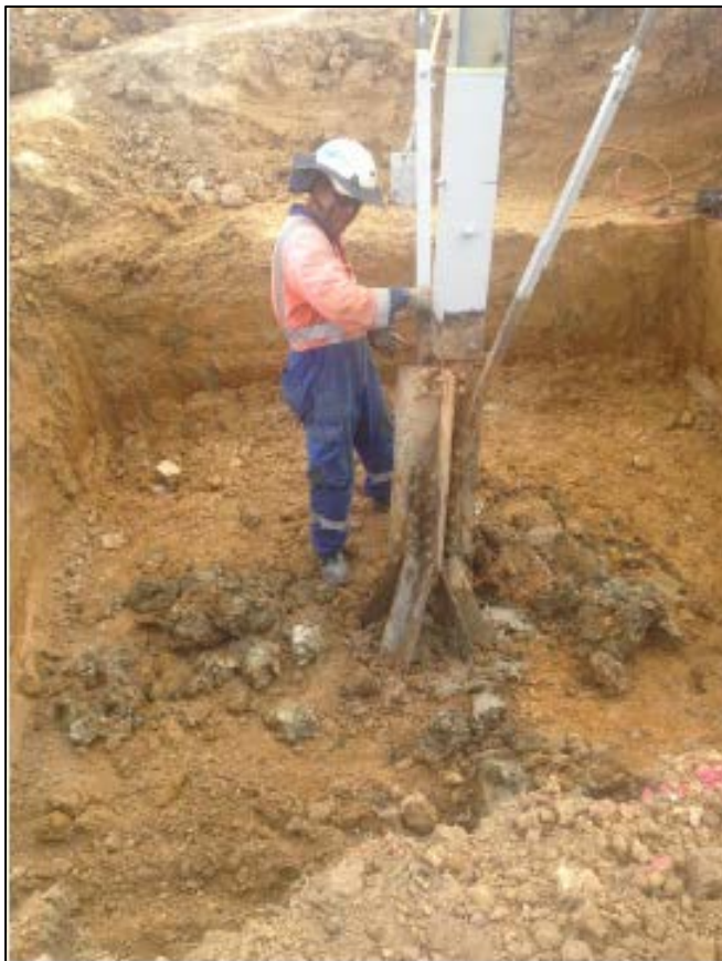
Figure 10 Land disturbance for grillage foundation strengthening.