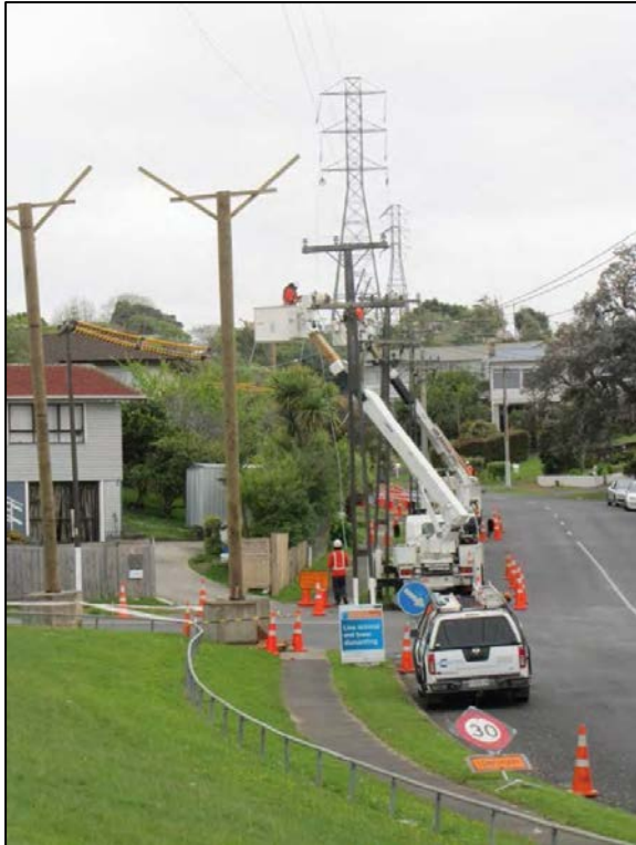
Figure 22: Removal of copper conductor