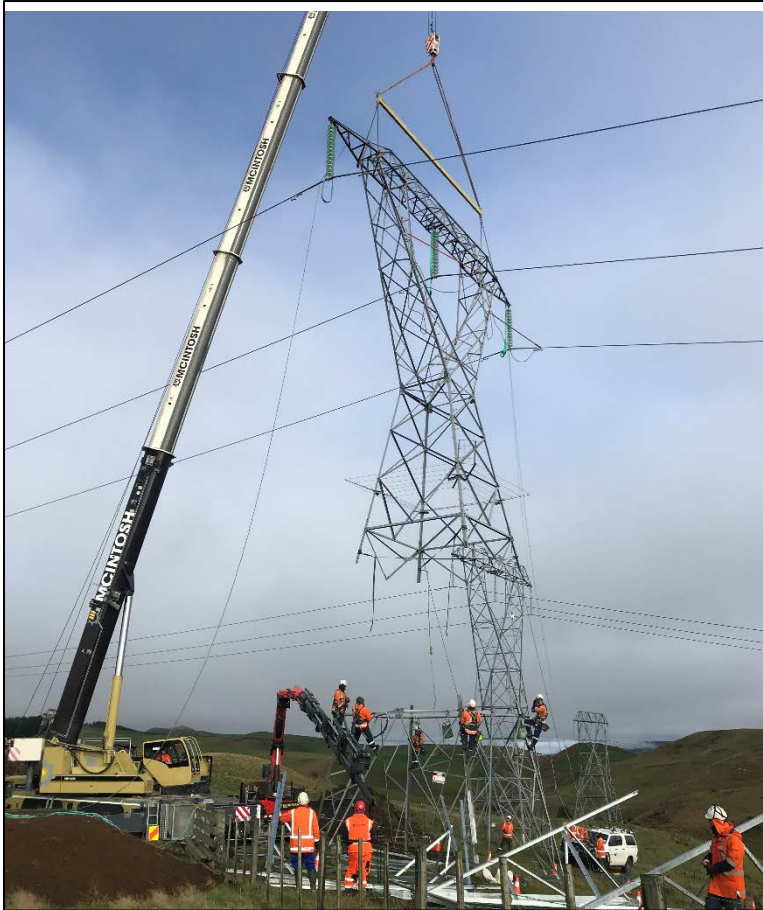
Figure 16 Parallel Body Extension being installed on the BPE-WRK-A line.