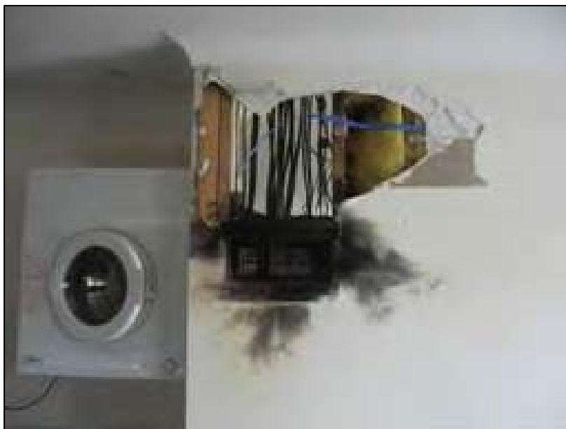
Figure 3 Electrical damage following a conductor drop.