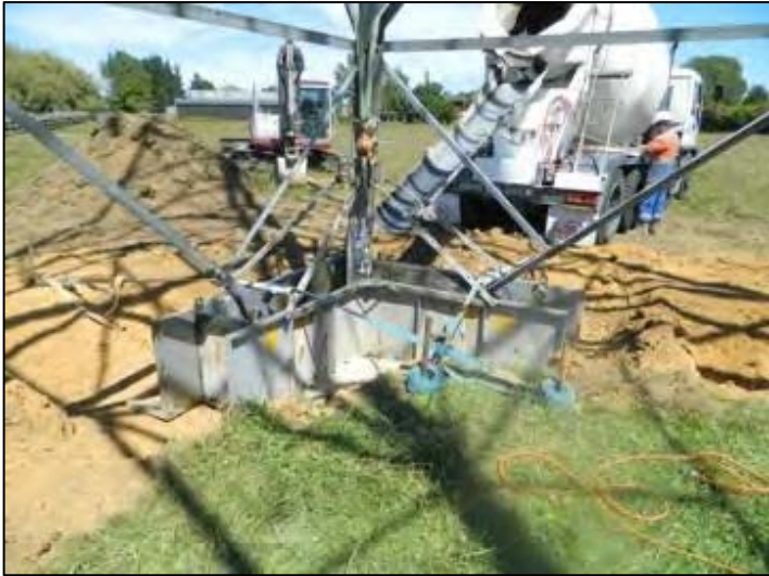
Figure 9 Tower Grillage foundation replacement