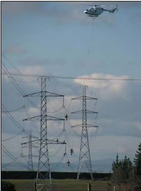
Figure 15 Maintenance work being carried out using helicopters.

2.31 Access for maintenance work on conductors presents its own challenges. For example, access to conductors is usually limited to ground base operations using elevated work platforms or cranes or lowering the conductor to the ground. In some cases, it is possible to suspend line mechanics from helicopters, but this involves long periods of helicopter time while the work is being carried out below.