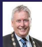
Mayor David Trewavas