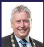
Mayor David Trewavas

To find out more, call us on 0800 ASK TDC (0800 275 832).