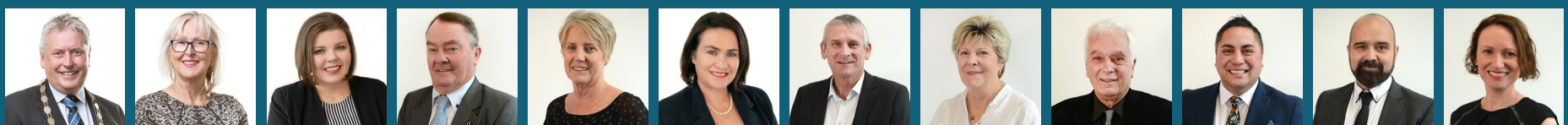
Mayor David Trewavas

@ Email your elected members at councillors@taupo.govt.nz