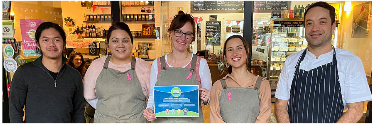
The team at Cozy Corner with their Resource Wise Business Programme platinum certificate.