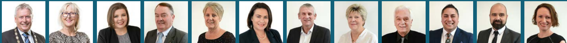
Mayor David Trewavas

@ Email your elected members at councillors@taupo.govt.nz