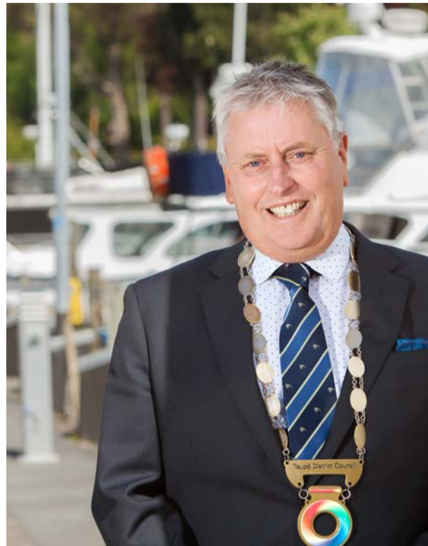
Taupō District Mayor David Trewavas

TAUPŌ DISTRICT MAYOR David Trewavas has been returned for a fourth term with a preliminary result of 6464 votes.