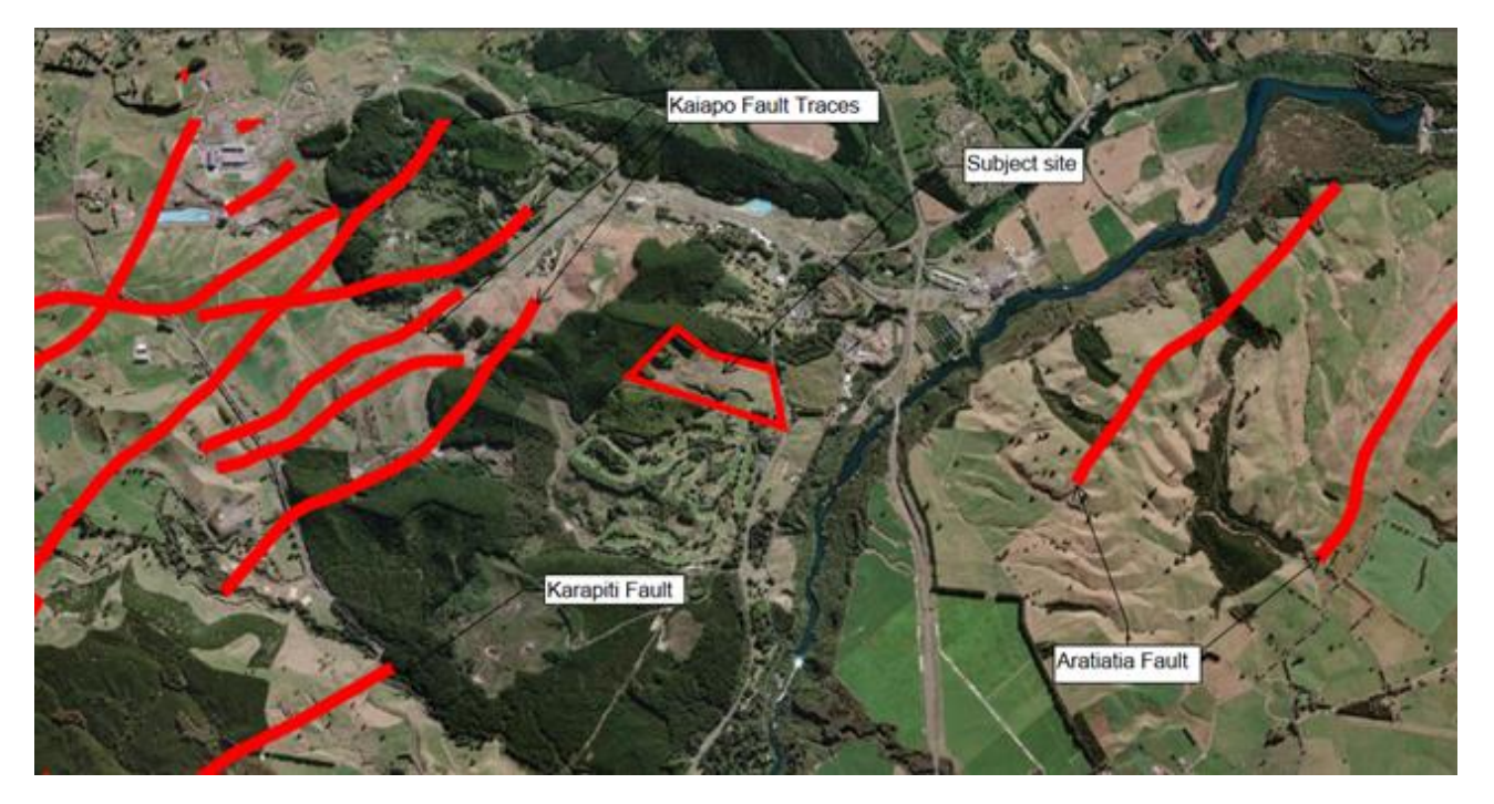
Figure 4-3: Fault Locations