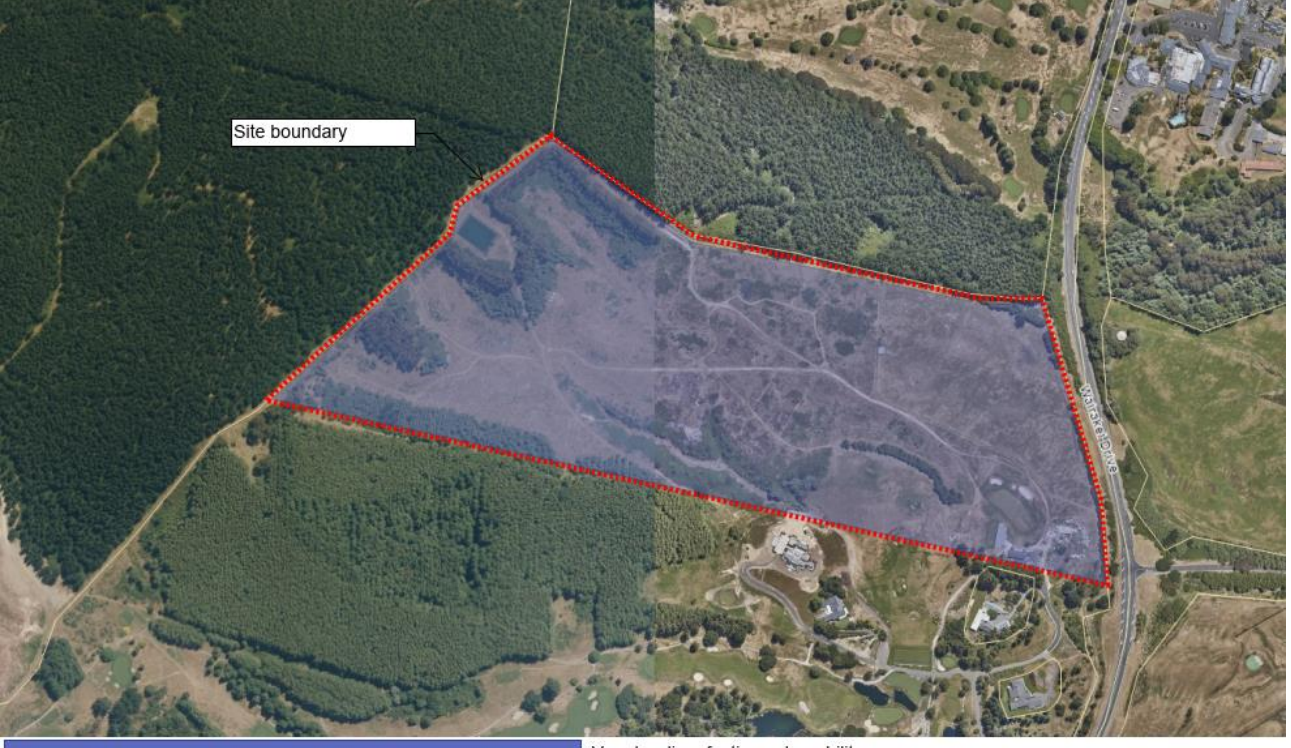
Very low liquefaction vulnerability