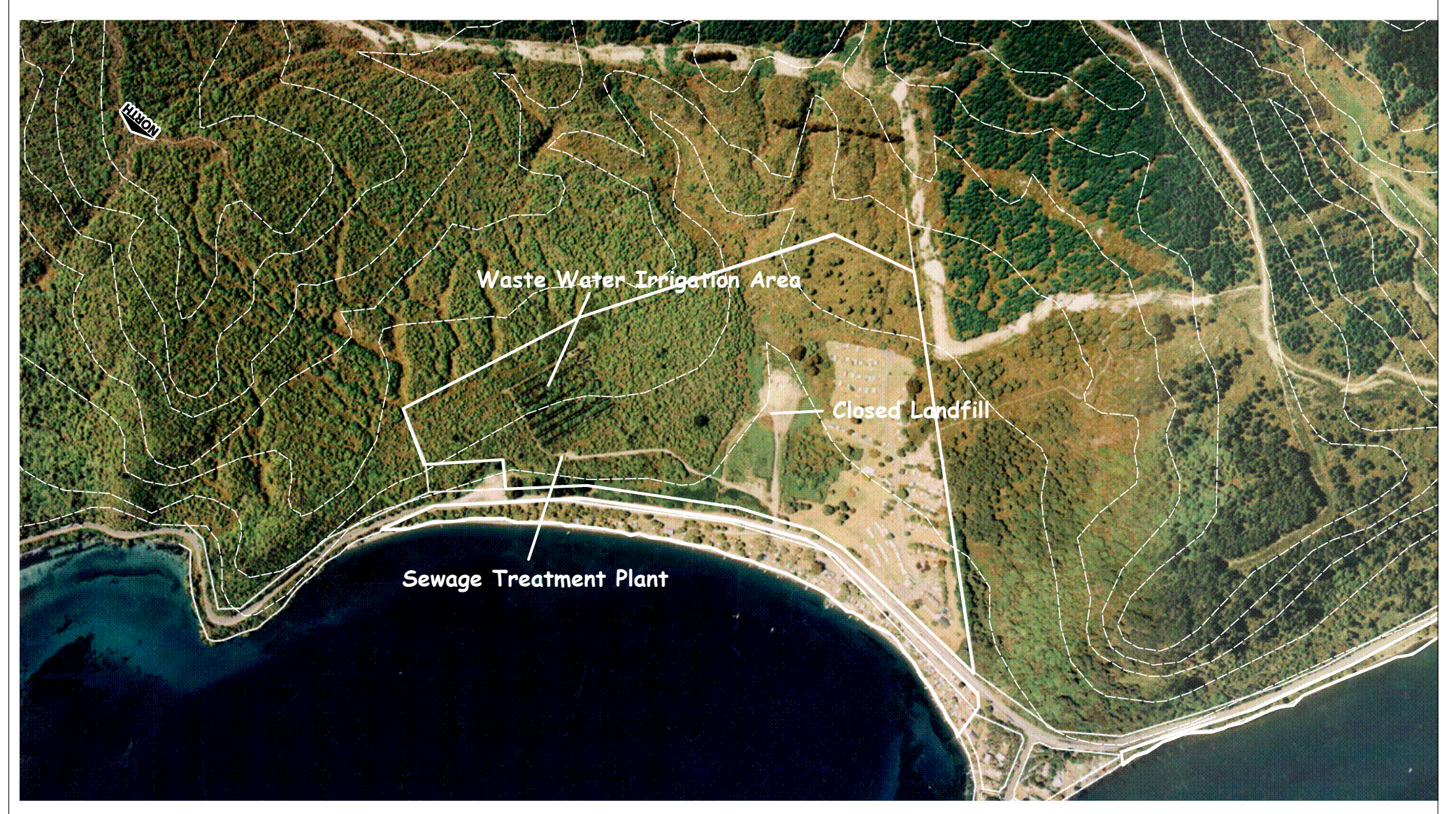
Figure 6 - Sewage Treatment Plant and Closed Landfill Sites